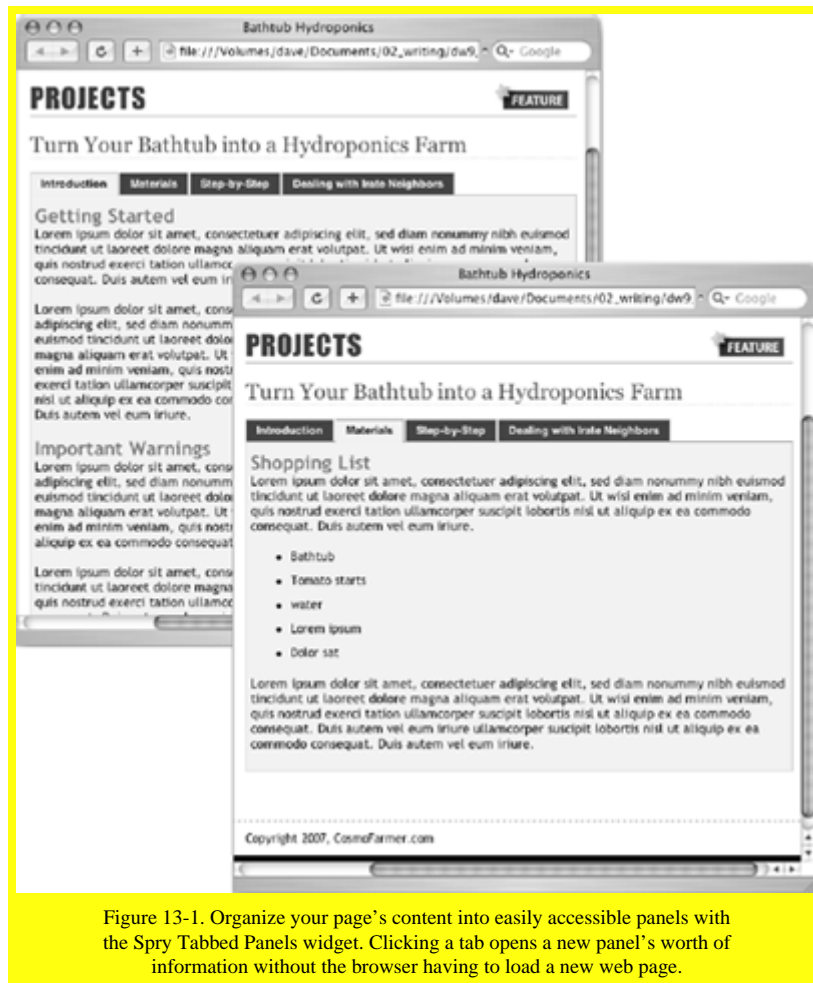
Figure 13-1. Organize your page's content into easily accessible panels with the Spry Tabbed Panels widget. Clicking a tab opens a new panel's worth of information without the browser having to load a new web page.